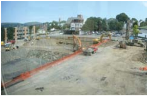
Work on the foundation continued through the summer and fall of 2006.