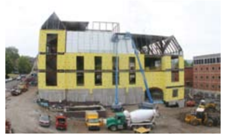
Exterior insulation was applied to the building in the spring and summer of 2007.