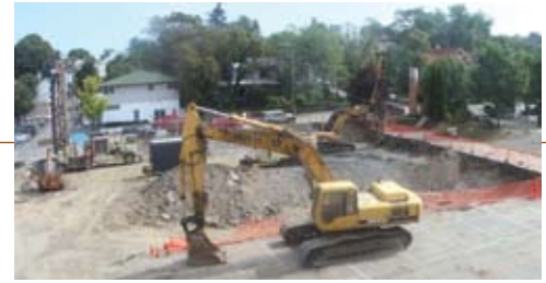
Excavation began in the summer of 2006.

a place where students will want to come and get to know one another. It's not just a cafeteria anymore."