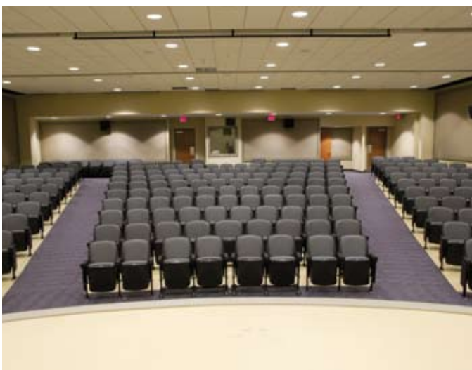
A 260-seat theater on the fourth floor boasts high-definition video, surround sound and comfortable, oversized theater seating.

There are additional a la carte dining options on first floor, including Quiznos, Starbucks, Chick-fil-A and Zoca. Along what Dr. Carilli refers to as “Main Street”