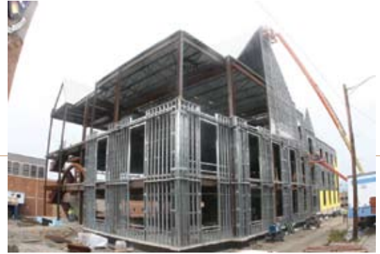
The building began to take shape with structural steel erection.

Most people also like it. In a survey about the Fresh Food Company conducted on opening day, 77 percent of diners said the food quality was “excellent, amazing, awesome, good.”