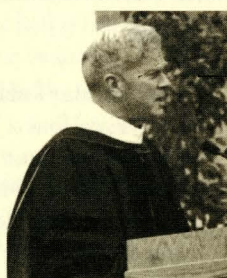
James H. Billington, Librarian of Congress, was the principal speaker at the convocation. The University awarded Billington an honorary doctorate.