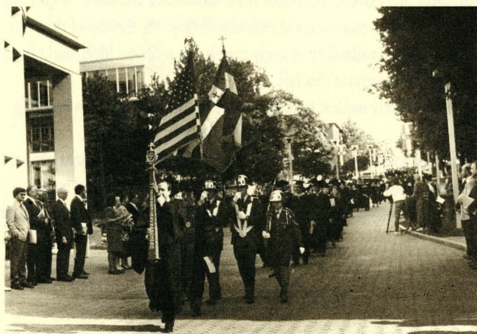
An academic procession initiated the Sept. 25 convocation for the dedication of the new Harry and Jeanette Weinberg Memorial Library. Nearly 1,000 members of the University community, alumni and friends attended the ceremony.

The Harry and Jeanette Weinberg Memorial Library was dedicated on September 25, during an academic convocation at which the Librarian of Congress, James H. Billington, gave the major address and received an honorary degree.