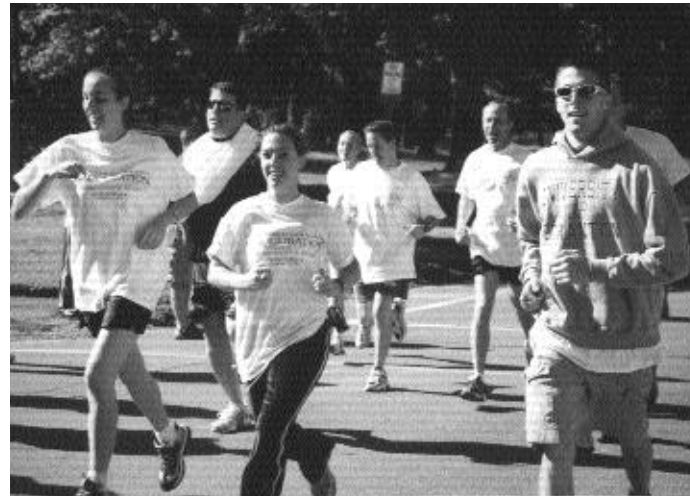
About 150 people turned out for an Inauguration 5K Run/Walk on Sept. 21.

To view video excerpts, the full text of speeches and additional photos from Inauguration, visit the Web site at www.scranton.edu/inauguration .