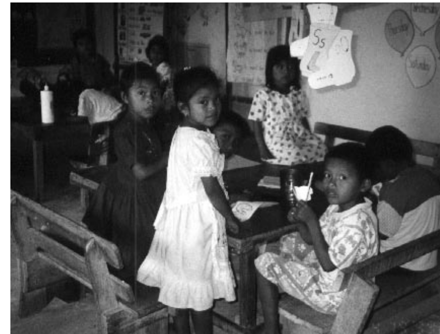
Belizean kindergarten classroom

I traveled to remote Mayan villages each day and worked with teachers in their classrooms, as more of a supporter than a trainer. Some teachers asked me to model lessons, some to team teach, and some just to help around the class. The experience was indescribable.